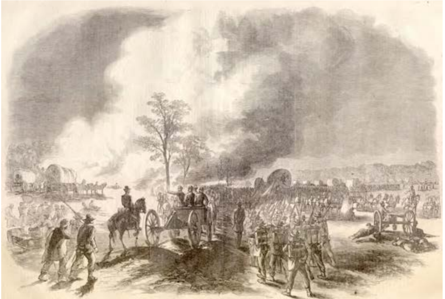
The above sketch shows the retreat of Franklin's corps at the Battle of Fair Oaks

Contact Norm at Normandy@verizon.net or (973) 809-0283