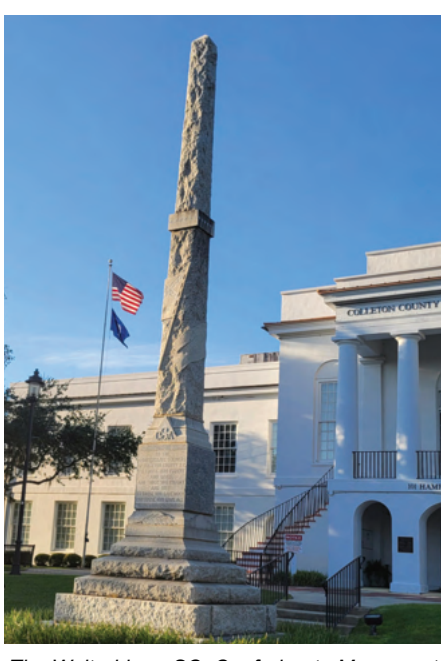
The Walterbioro, SC Confederate Monument