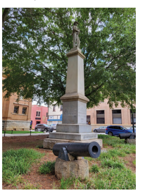
The Statesville, NC Confederate Monument

Sadly, we have not found similar sentiments carved on any monument to our Union soldiers. Perhaps, someday, we will – our travels continue.